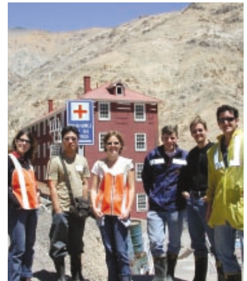
International Management students Codelco Copper Mine, Santiago, Chile